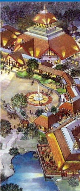
Architecture & Building Engineering

Engineering, Architectural & Environmental Consultants