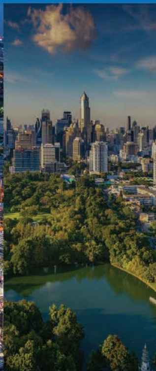
Resources Development & GIS